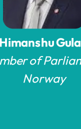
Himanshu Gulati Member of Parliament, Norway